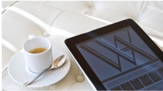
Waldorf Astoria iPad